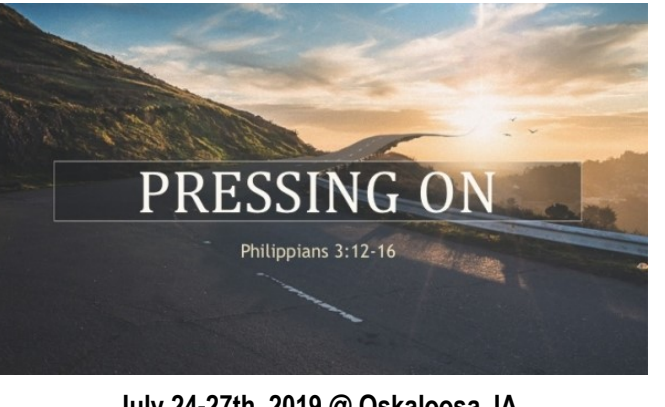
July 24-27th, 2019 @ Oskaloosa, IA

Add together all Meal items and subtotal in orange Box