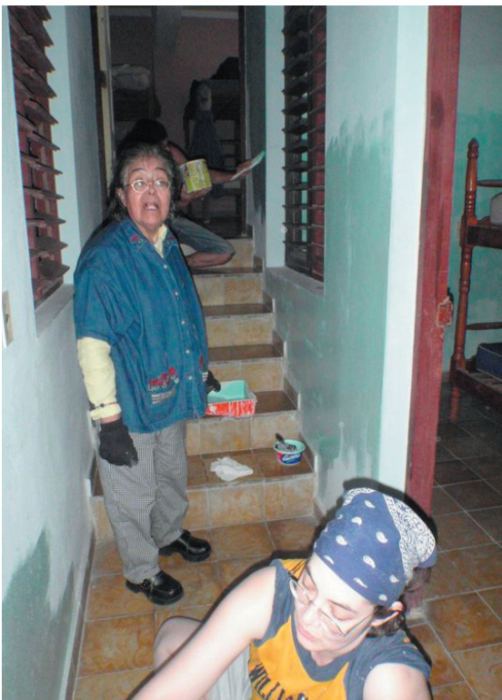
One of the work projects in Cuba was to help with some painting.