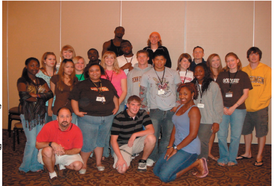
Our group that attended a fall conference in Kansas City.

Since we are focusing our chapel services on the gospel of Luke this year, I decided to focus around the common theme of that book, which is, according to commentators, "For the Son of Man came to seek and to save the lost." Therefore a reoccurring statement for us in campus ministry in "Encouraging and Equipping Followers of Jesus to Seek and to save the lost."