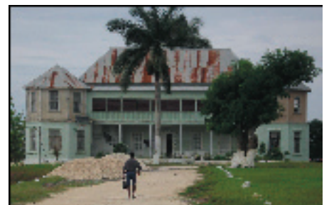
Swift-Purscell Boys Home