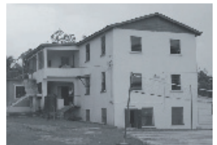
Lyndale Girls Home